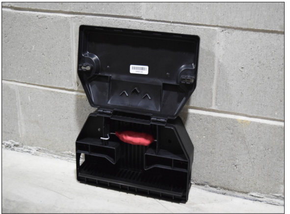
Can be used vertically or horizontally