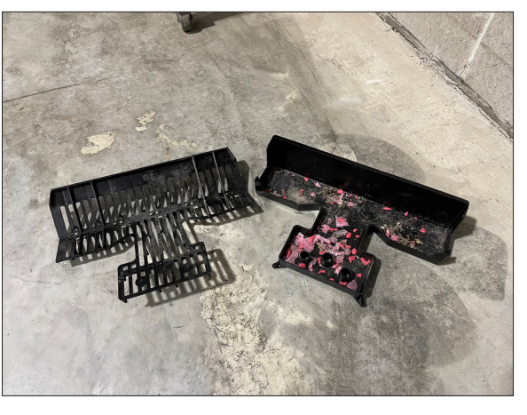
Quickly clean out & service by removing from the station