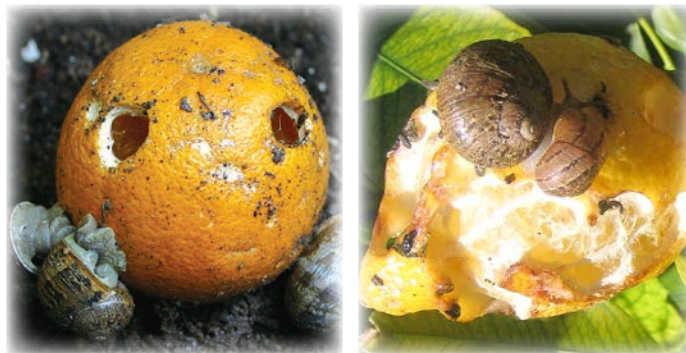
Snail feeding damage to citrus.